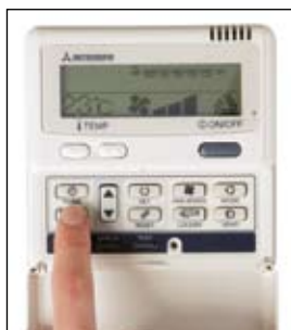
RCE1 Wired Controller