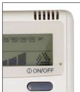
Integral Temperature Sensor

Energy Saving up to 38% with INVERTER Technology