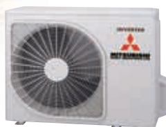
SRC20ZJX-S, SRC25ZJX-S, SRC35ZJX-S