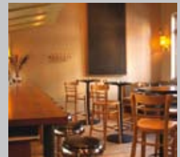
RESIDENTIAL • SMALL OFFICES • HOTELS • SHOPS • CONSULTING & TREATMENT ROOMS

The new SRK INVERTER range combines sophisticated micro-processor energy saving controls with advanced refrigeration technology, applied to small air conditioning/heat pump systems.